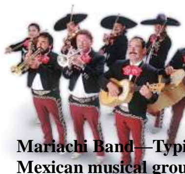
Mariachi Band—Typical Mexican musical group

Mexico City has a population of 22 million—third largest city in the world.