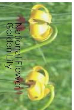
National Flower Golden Lily